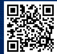
Student Helper Sign-Up