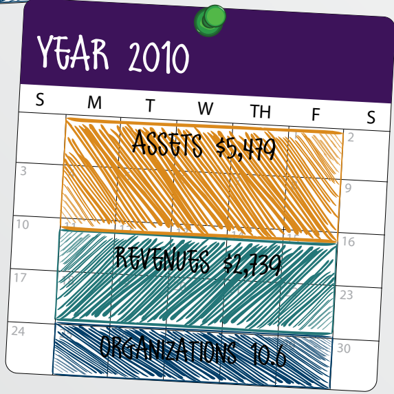
O.C. Charities by Organization size

28% U.S. GROWTH IN THE # OF NONPROFITS 2000-2010