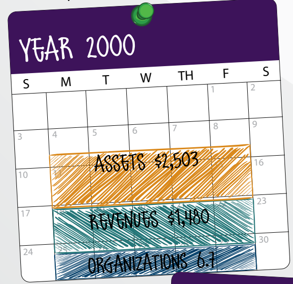
Orange County Charities' Resources per 10,000 residents

70% O.C. GROWTH IN THE # OF NONPROFITS 2000-2010